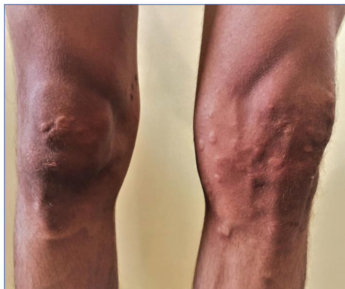
[Table/Fig-2]: Multiple wheals of varied sizes without much erythema can be seen over both legs in asymmetric fashion mostly present around the knees and shin.

Based on the history, physical examination and no response to antihistamines, a diagnosis of NICU due to ethanol-based hand sanitiser was made. This patient received low dose of