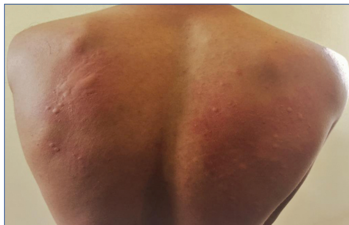
[Table/Fig-1]: Multiple wheals of varied sizes and shapes with the background of erythema can be seen all over the back particularly distributed over scapular area.

On examination, there were multiple urticarial wheals of different sizes ranging from approximately 1 cm in diameter to as large as 10 cm, which were distributed unevenly all over the body, having erythematous base at some places. The lesions were firm to touch, non-blanchable and non-tender on pressure [Table/Fig-1,2].