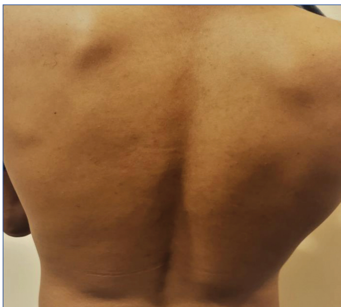
[Table/Fig-3]: All the wheals over back disappeared after treatment.